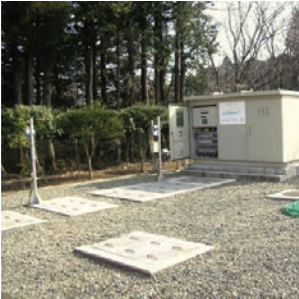
Upper concrete work