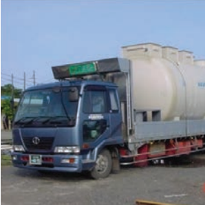
Ship to site